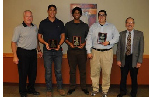
This year's Student Excellence Award Recipients for Rec Sports.